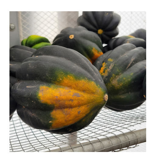
Wash your Vegetables before cooking or eating raw.